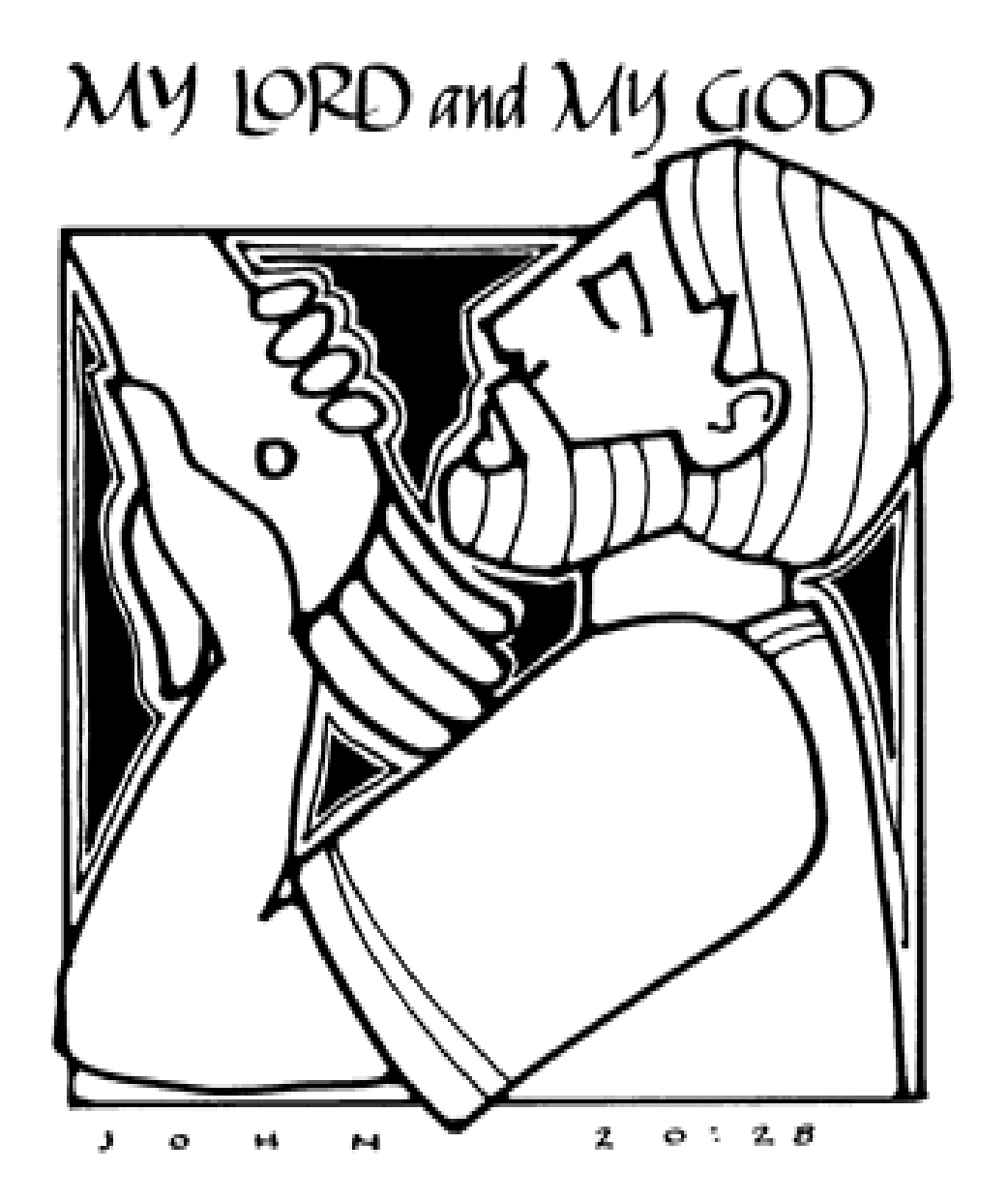
Mass for 'Low Sunday' (2<sup>nd</sup> Sunday of Eastertide) together with the Newsletter, Issue 54 11 Apr 2021