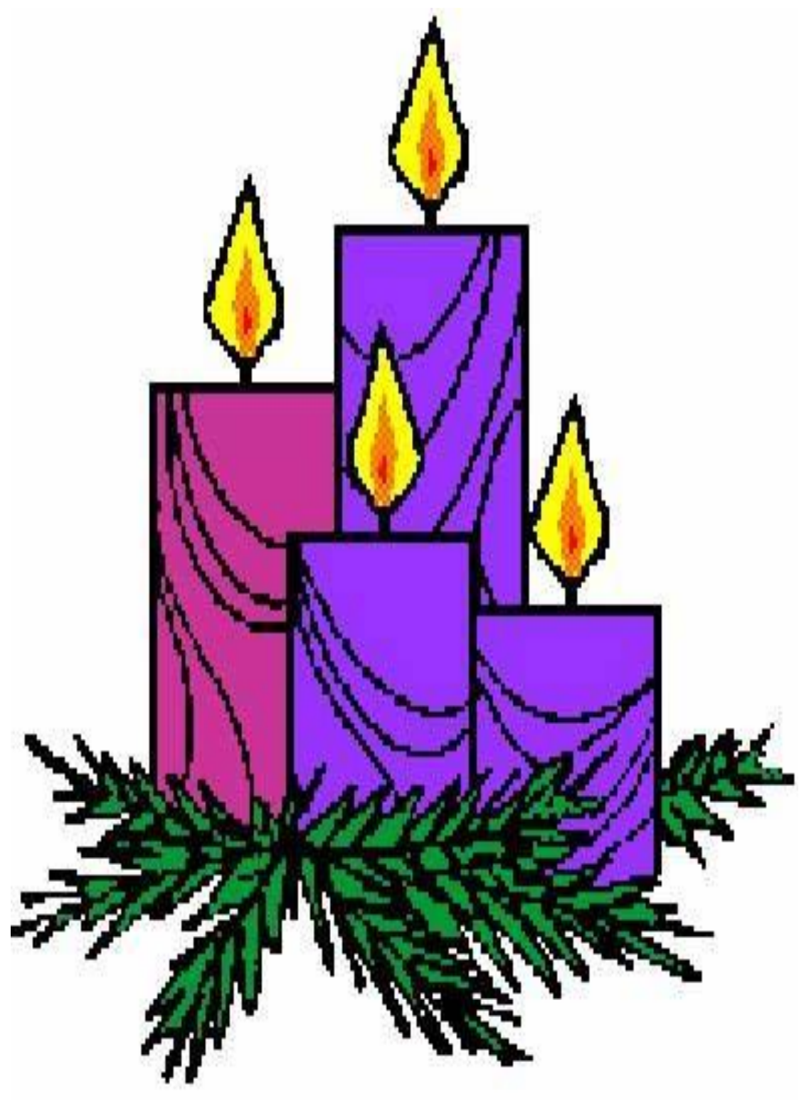
Mass for ADVENT FOUR together with the Newsletter, Issue 39 20 Dec 2020