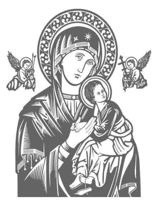
The Angelus: please use this in your own homes to pray at noon each day

PRAY FOR THE DEPARTED: All those who have died from this terrible virus